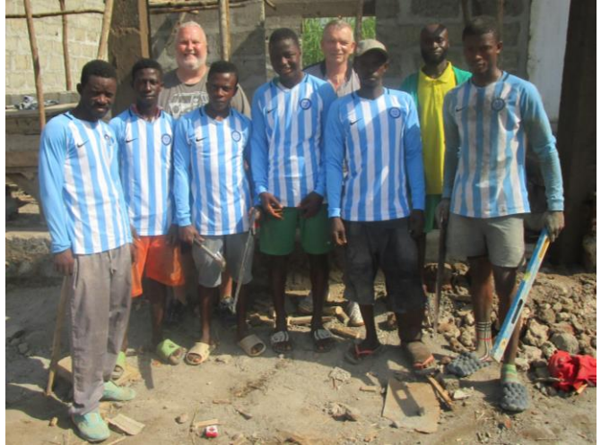
The pupils waving goodbye on our last day on site.

The temperature was about 30c & the humidity was about 80%, but the guys just pace themselves. All the builders were presented with a "team" shirt, kindly donated by Cumnor Minors FC, Oxford.