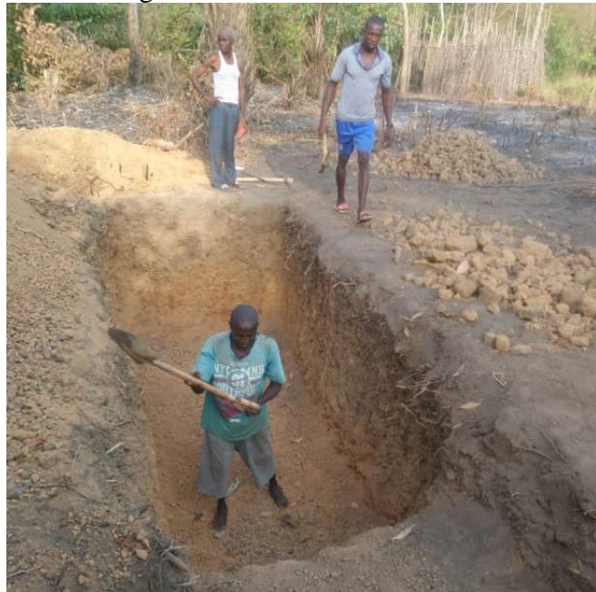
The project is now fully funded

In just two weeks they have dug the pit for the toilet block. It measures 6M x 1.5M x 3M deep – a total of 27 cubic metres & it’s all dug manually!! Somebody, a bit brighter than me, can probably work out how many tons they have shifted! They have now started to build the pit walls and have put in the first set of concrete cross beams for added strength.