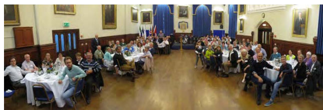
International Fellowship in Banbury Town Hall

Thursday 29 th May saw the arrival of 58 Rotarians from France, Germany, Italy and Switzerland, all ready to enjoy (we hoped!) a weekend of fellowship and entertainment - the culmination of 10 month's planning by the Banbury Contact Committee. 22 visitors to be hosted in Rotarian's homes and the rest cosseted in the Banbury House Hotel.