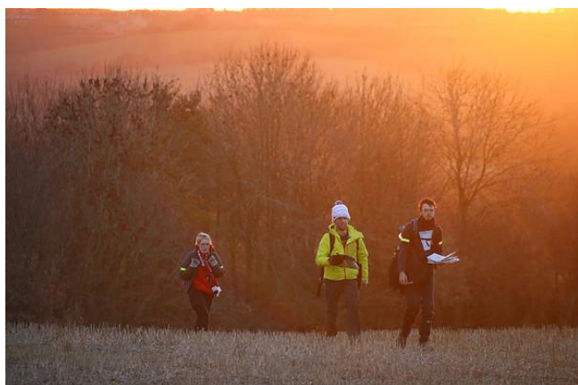
(the Rotaract team around sunset)

All the volunteers on the day were great. All very supportive yet at the same time telling us we were mad for trying. However they encouraged us to give it our best shot while still making sure we were having fun.