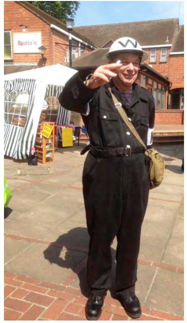
Who does he think he's kidding!